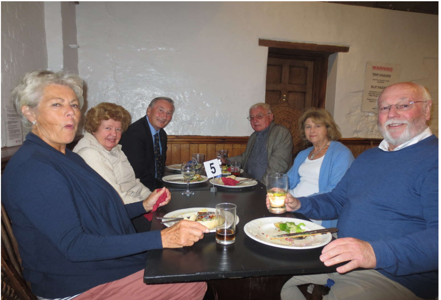
All smiles on the President's table at the Spur on 3rd September