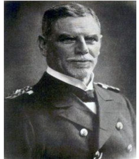
Vice Admiral Maximilian von Spee

Britain's Falklands Squadron, commanded by Rear-Admiral Sir Christopher Cradock, comprised HMS's Good Hope and Monmouth , both of 1901, Otranto , a converted liner, and the obsolescent Canopus of 1897. Only the light-cruiser Glasgow was relatively new and crewed by regulars. After occupying several German Far-Eastern bases, Cradock received ambiguous Admiralty orders which he interpreted as