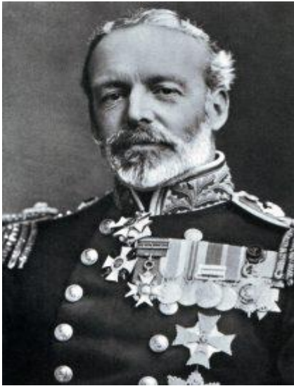
Rear Admiral Sir Christopher Cradock

Already in September 1914, a single U boat had torpedoed three British cruisers blockading Germany in the North Sea costing 1,459 lives, shocking a nation used to Britain's virtual invincibility at sea. Worse was to follow. In August 1914, the modern and efficient German Navy's East Asia Squadron, under Vice-Admiral Maximilian von Spee, was stationed in the Pacific to disrupt Allied trade and destroy communications. Armoured cruisers Scharnhorst and Gneisenau , each with eight 8.2" guns, were accompanied by three light-cruisers, Dresden , Leipzig and Nurnberg , all commissioned after 1907 and crewed by experienced regulars.